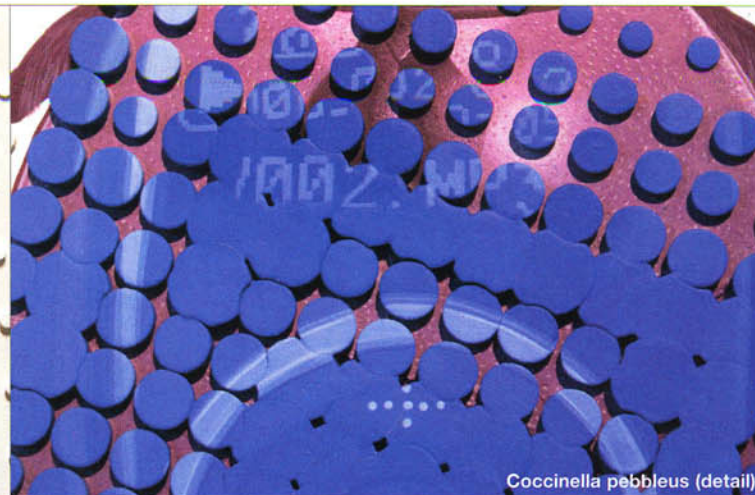
Coccinella pebbleus (detail)