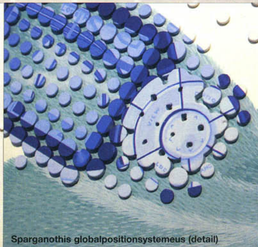
Sparganothis globalpositionssystemeus (detail)