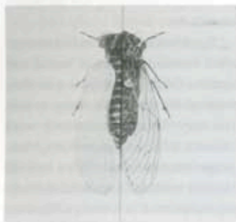
Paul Paiement, "Hybrids B-Tettigia Screwini," egg tempera on panel, 25 1/2 x 23", 1999.